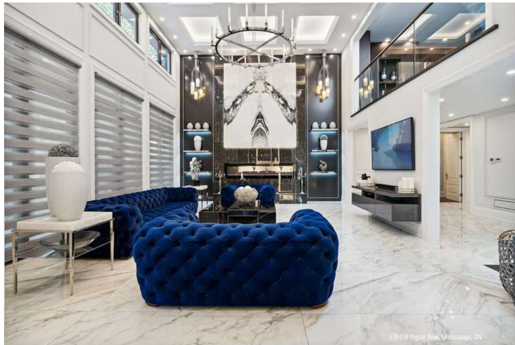
539 Old Poplar Row, Mississauga, ON

For a luxurious, dramatic living room design, try painting the walls in hues of dark plum, mahogany, or even black. To avoid overpowering the rest of the house, keep the remainder of your design light, with white, cream, and metallic accents as counterbalance. For added flair, invest in ornate, Victorian-inspired furnishings in solid, neutral colours. Thick, floor-length curtains add a hint of theatricality.