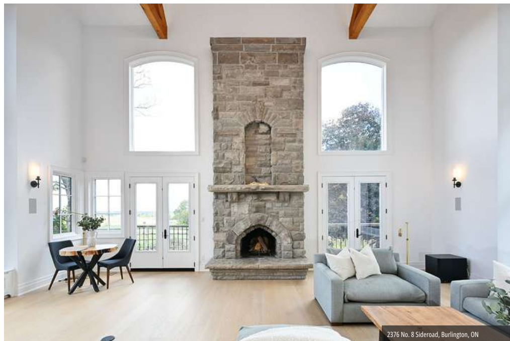
2376 No. 8 Sideroad, Burlington, ON