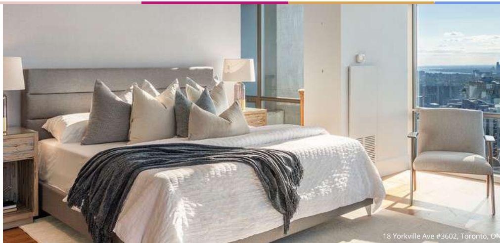
18 Yorkville Ave #3602, Toronto, ON

Lighting is an important element. Start with the most basic ambient lighting need as your first point of light, and then follow with lighting focused on task-specific areas, such as a work space or reading area.