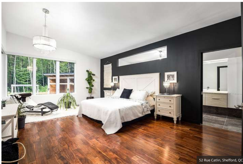
52 Rue Catlin, Shefford, QC

Select one, really great, standout element for the room and then decorate around that. That could mean a lovely painting over the bed or a beautiful vase. Invest in things that add beauty. Just a few nice pieces are all you need to set the tone. Not only is clutter unattractive, it takes away space that you might need to store your belongings, rest and relax.