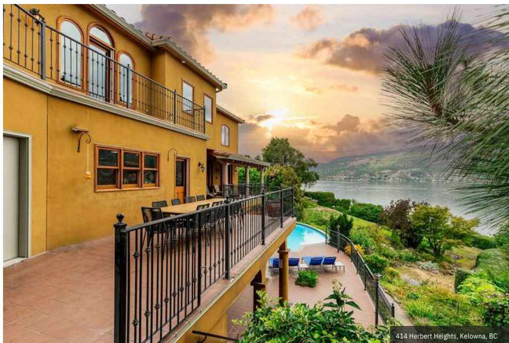
414 Herbert Heights, Kelowna, BC

With Canada's highest concentration of seniors per capita, Parksville has been referred to as "Canada's retirement capital". Parksville boasts a mild climate year round, scenic golf courses and parks, and plenty of opportunities for boating, kayaking, and more on the Strait of Georgia.