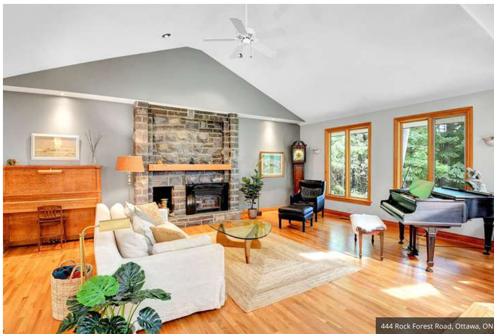
444 Rock Forest Road, Ottawa, ON

Situated on the picturesque shores of Lake Ontario, Niagara-on-the-Lake is a charming city with a rich history and vibrant culture with plenty of galleries, museums, award-winning restaurants, and events throughout the year. The city is also in the heart of Ontario's wine country, with over 50 wineries throughout the Niagara region.