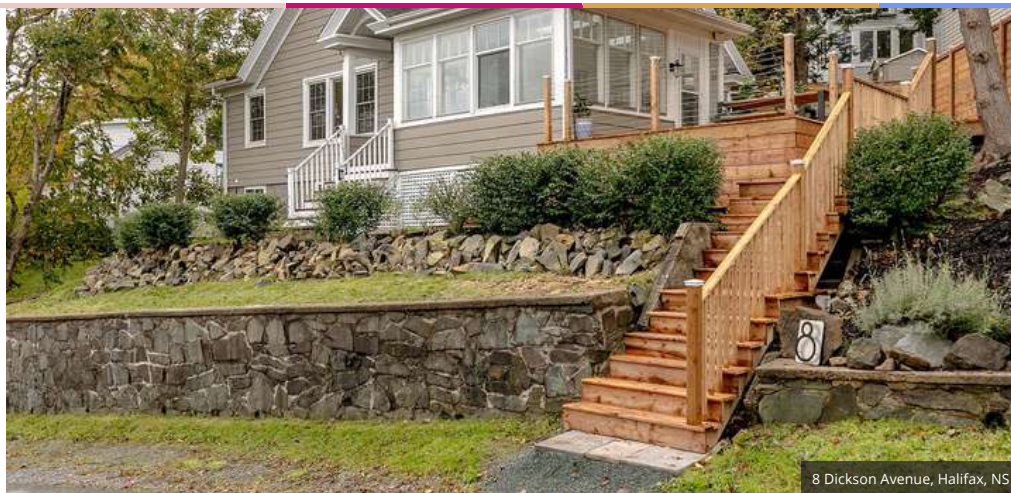
8 Dickson Avenue, Halifax, NS