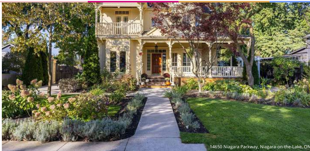
14650 Niagara Parkway, Niagara-on-the-Lake, ON