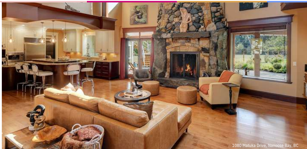
1080 Matuka Drive, Nanoose Bay, BC